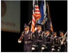
Hometown Heroes posted Aug. 16, 2010