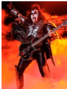
KISS brings antics to SPAC posted Aug. 18, 2010