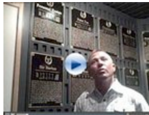
Thoroughbred Racing Hall of Fame inductions