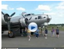
Take a ride on a B-17 aircraft