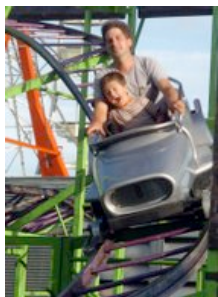
Fun at the Altamont Fair posted Aug. 18, 2010

but that wasn't always the case. That is, however, where the collection had its first of many homes soon after the company went out of business in 1969.