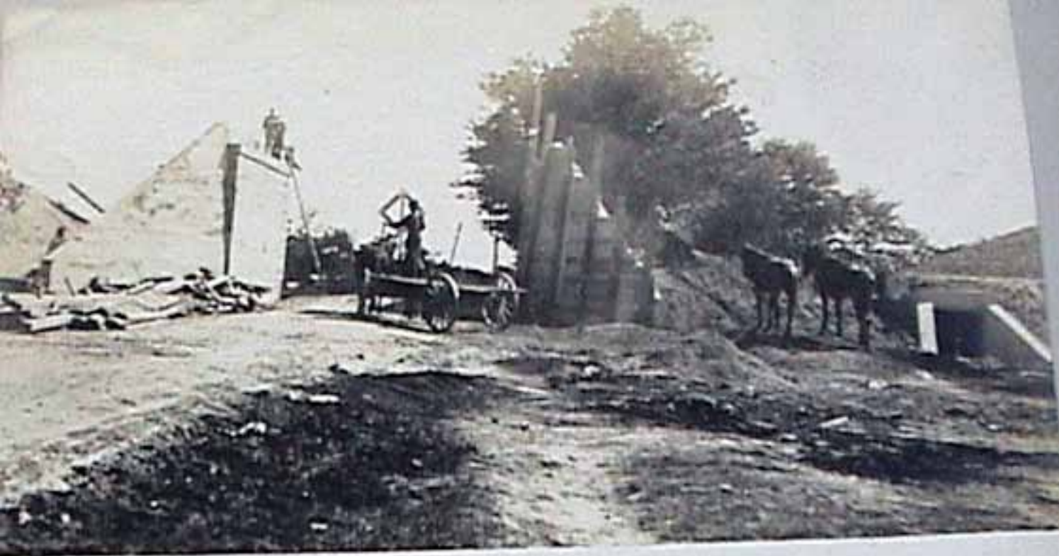
Bridge at Jerusalem Rd.