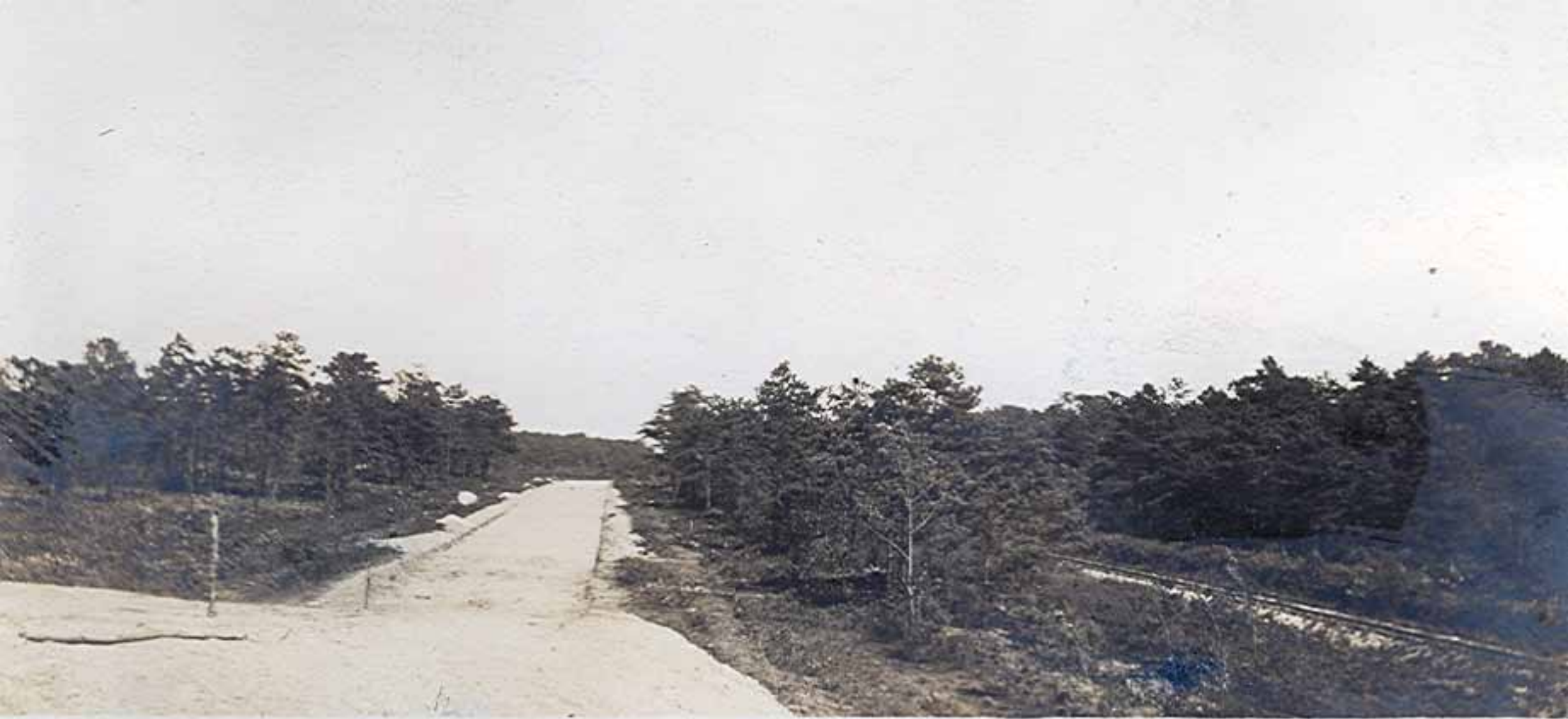
View looking East from bridge at Jerusalem Rd.