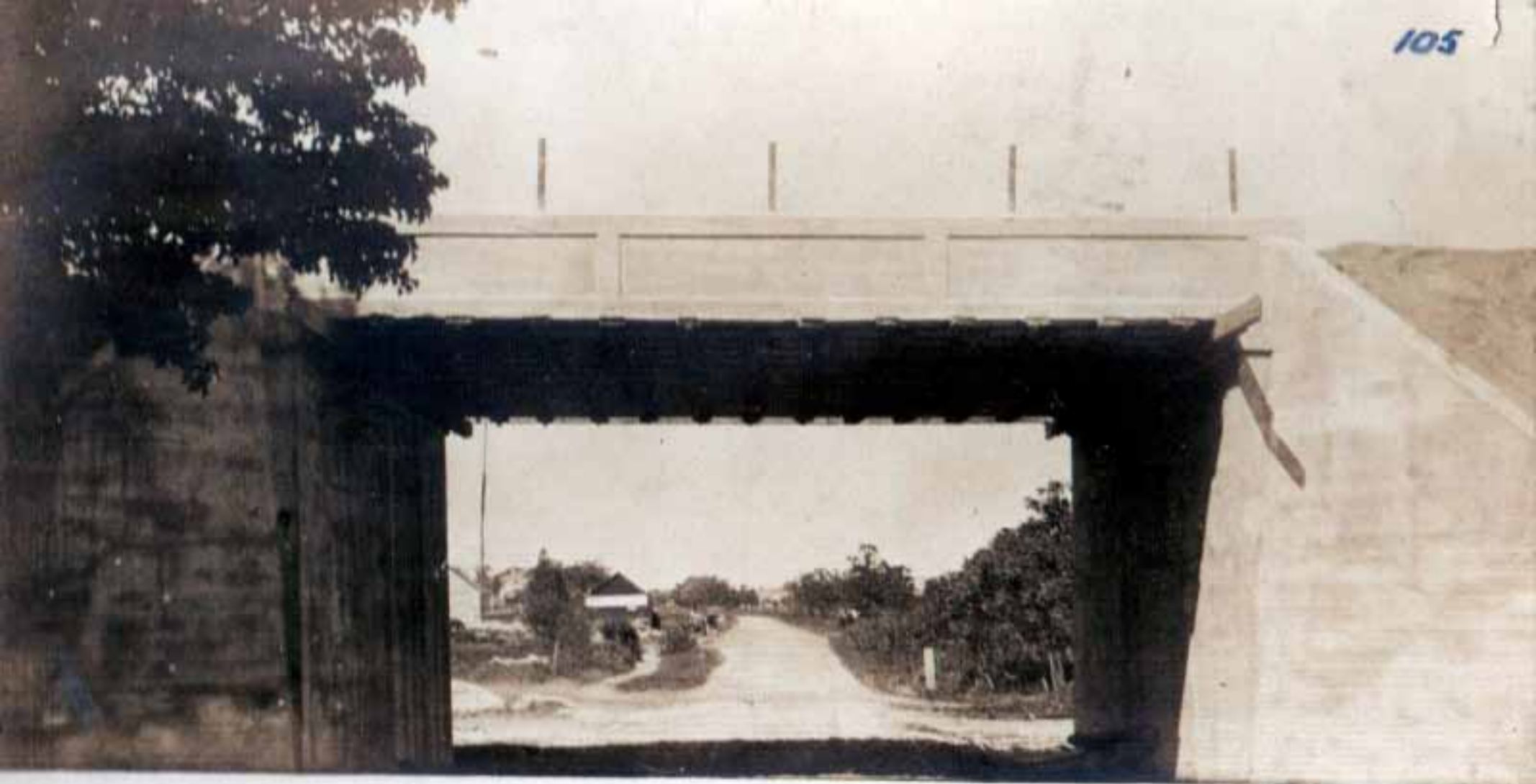
Jerusalem Rd. bridge