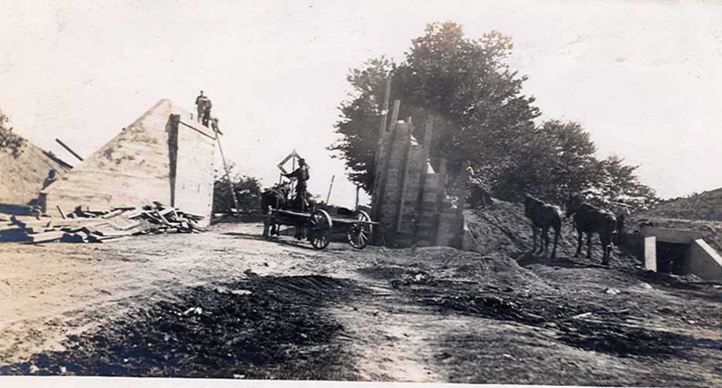
Bridge at Jerusalem Rd.