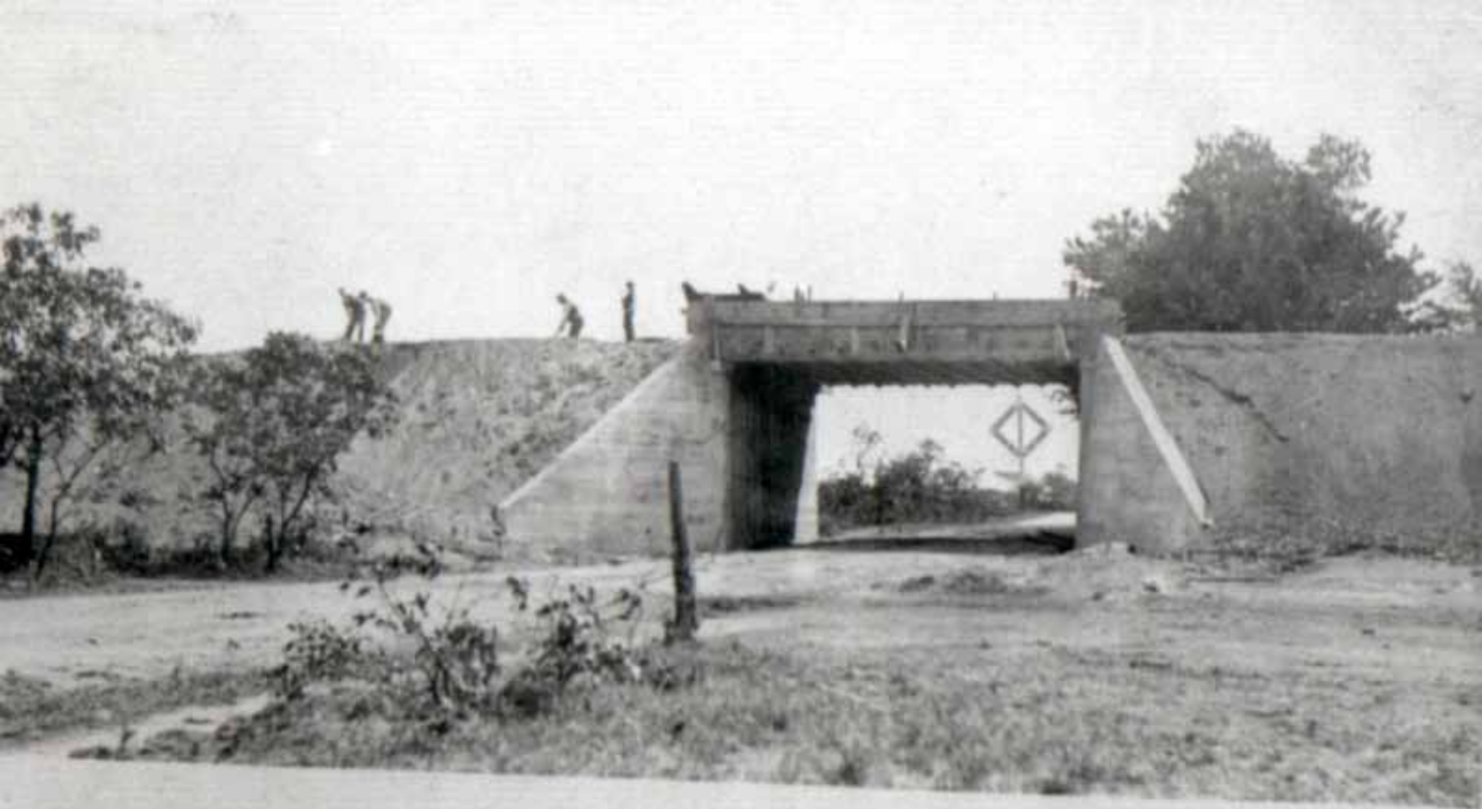
View looking South through bridge over Jerusalem Road