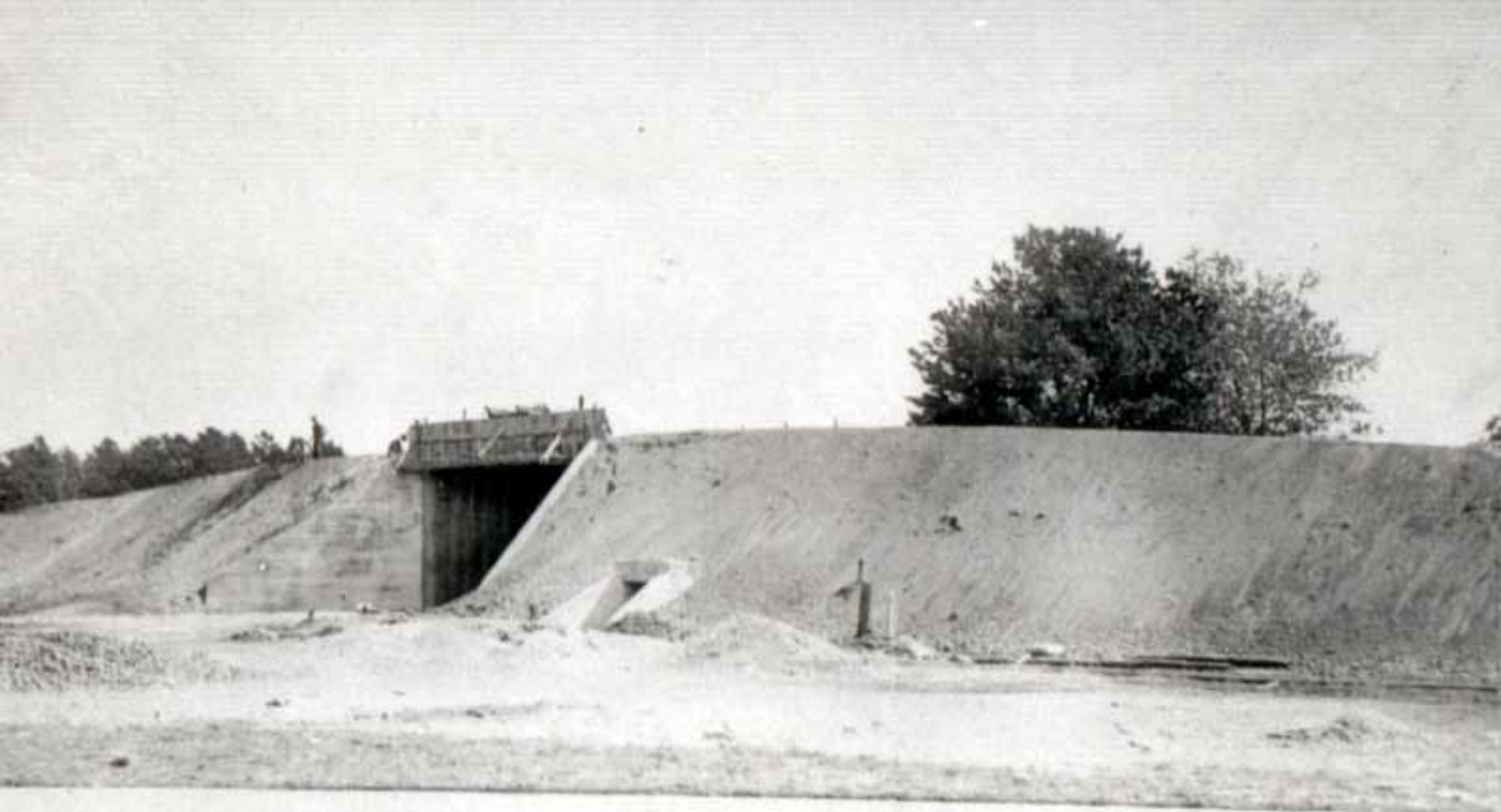
View showing car crossing bridge over Jerusalem Road