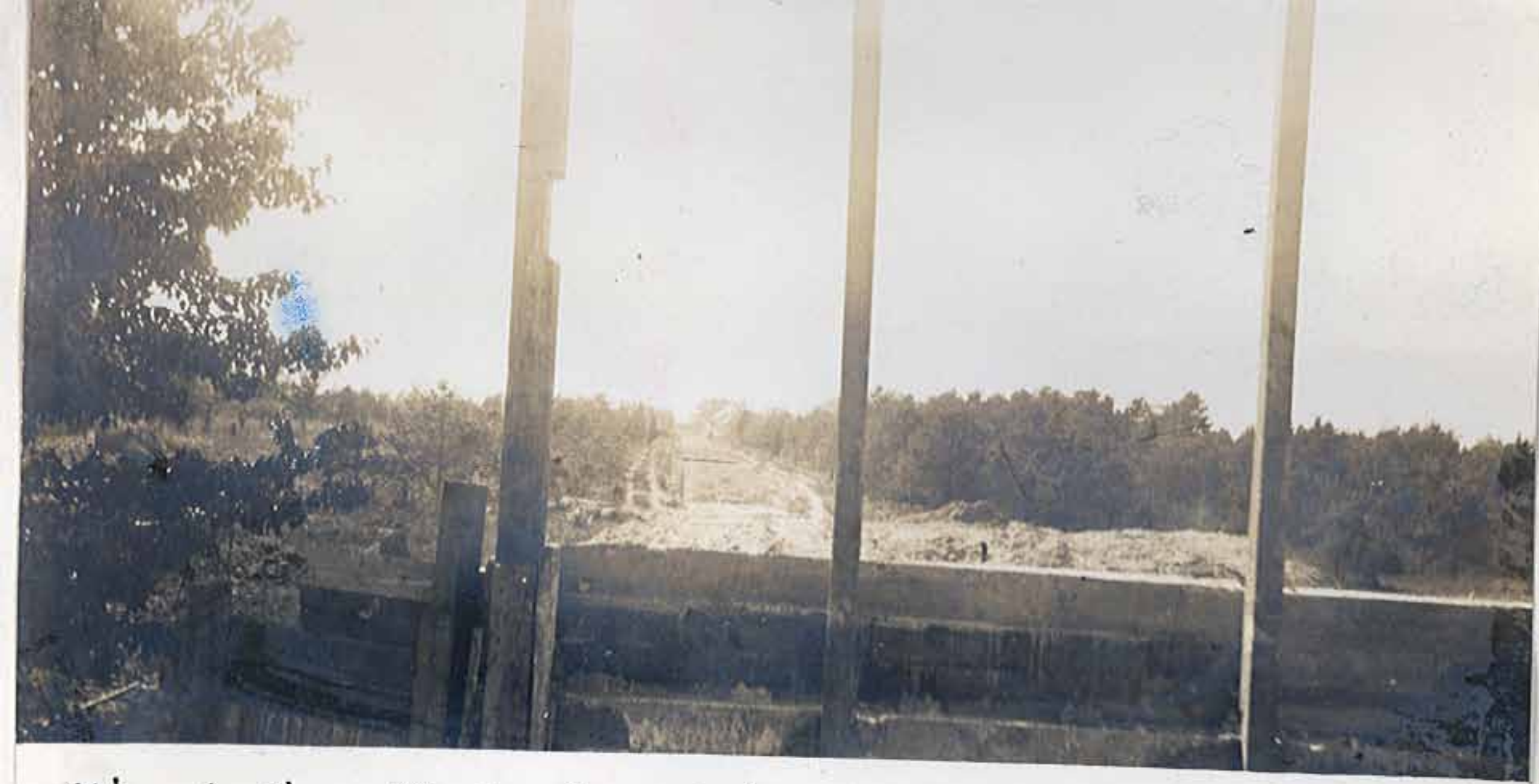
View looking North from bridge at Jerusalem Ave. Aug 20 '08