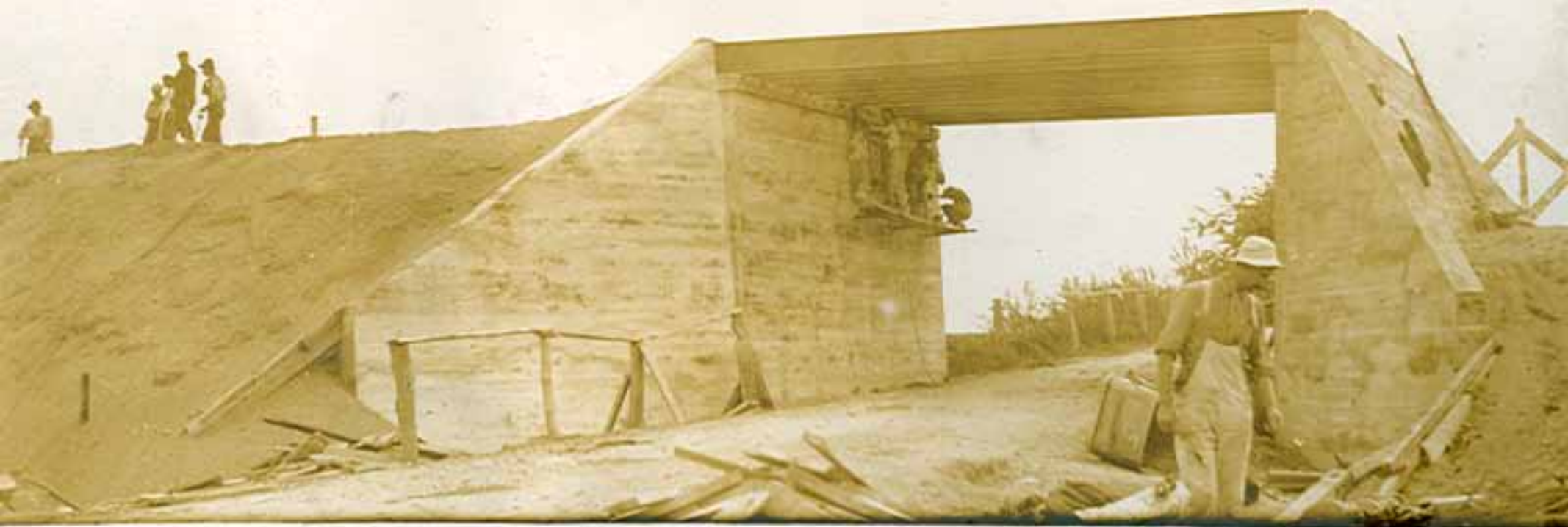
View looking South through bridge at Jerusalem Ave.