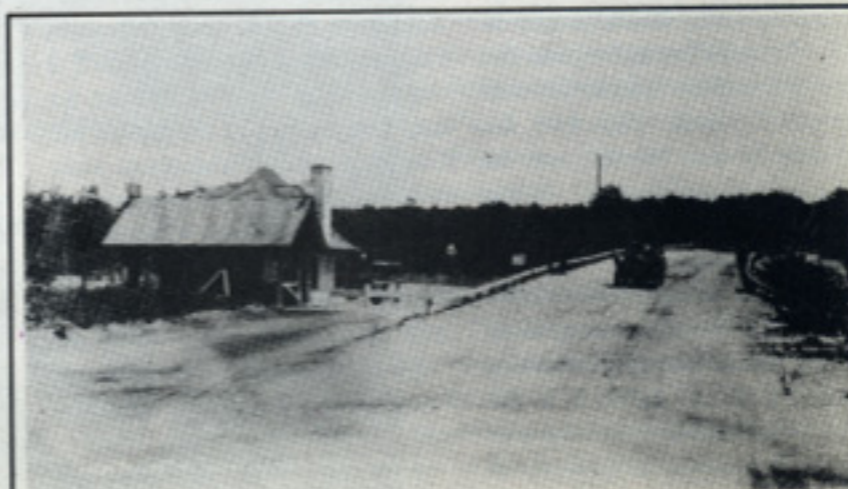
A motorist approaches the Bethpage Toll Lodge, one of 12 entry points to the Vanderbilt Parkway. The car would enter to the left of the canopy, pay his fare and pick up the parkway running under the overpass.

How the Toll Lodge came into the hands of the Garden City Chamber of Commerce is still another pioneering