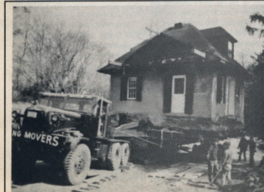
Nicholas Brothers makes Toll Lodge ready for move to 7th Street