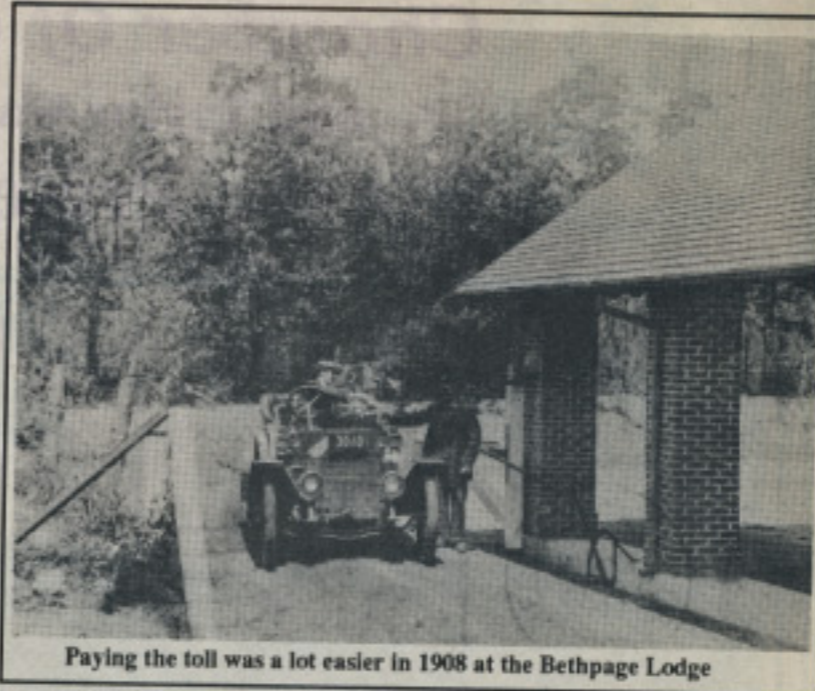
Paying the toll was a lot easier in 1908 at the Bethpage Lodge

born in 1878, the greatgrandson of Commodore Cornelius Vanderbilt, ship captain from Staten Island. Vanderbilts father and grandfather built on the Commodore's moderate wealth by pioneering the early days of railroads and now it was time for Young Vanderbilt to explore the potential of the automobile.