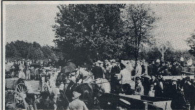
Groundbreaking ceremonies, June 6, 1908 in Bethpage was attended by hundreds of people mostly arriving by horse and carriage.