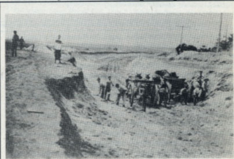
Some of the 2,000 laborers working on the parkway in 1908

Although construction used only horse, mule and manpower, it introduced almost all of today's road engineering techniques. Roadbeds were graded, guard rails were used, bridges were constructed on site of steel, and the most innovative practice of all was the steel reinforcing of the concrete for added strength to accommodate the vehicles of the day. Sections of the roadway are still in use as walking and bicycle paths through Cunningham Park and Alley