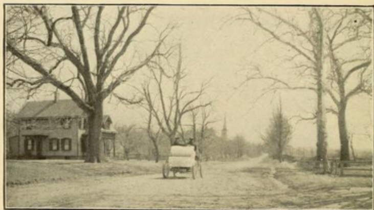
Fig. 2. East Norwich, L. I.