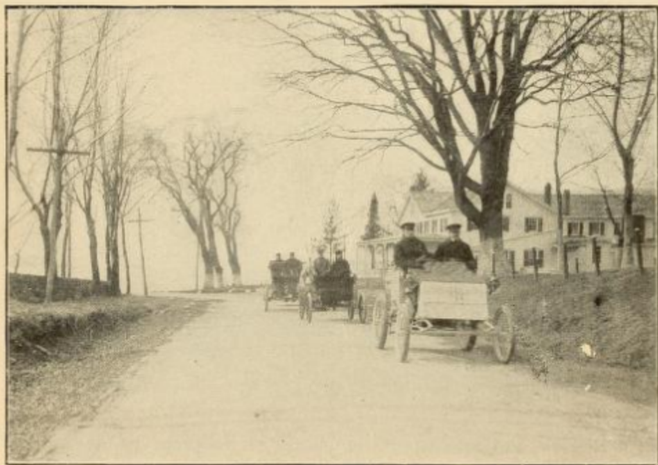
Fig. 1. Willett's Point, L. I.

THE Long Island Automobile Club's endurance contest which took place Saturday, April 20, was in all respects a decided success. The number of entries was quite encouraging, and the crowd which turned out to witness the event was sufficient evidence of the great interest taken in the automobile by all classes.